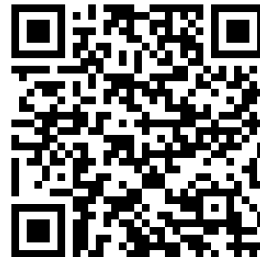
Step 3 Vote